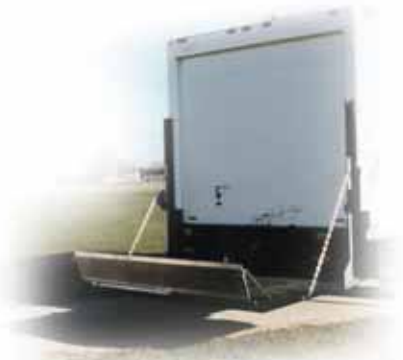
Optional retention ramp

* NOTICE: Some models of Anthony Liftgates may be provided with step devices to assist the ingress and egress of the truck or trailer rear. These devices are NOT to be considered ALL INCLUSIVE of any requirements or guidelines regarding proper ingress and egress of trucks and trailers. These items are provided as only an added feature for installers to help simplify the meeting of possible ingress and egress requirements. As there are many variables in truck sizes and shapes, it is the installer's responsibility to determine proper ingress and egress requirements, such as steps and hand grips, for each vehicle receiving an Anthony liftgate.