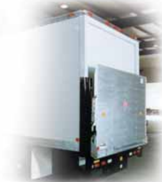
Optional aluminum platform