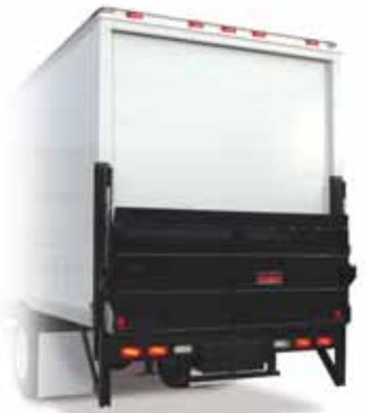
Standard Model in "stored" position

Provides long life with greater reliability than cable drive.