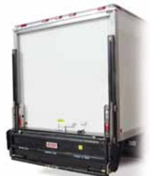
RailTuck Model in "stored" position