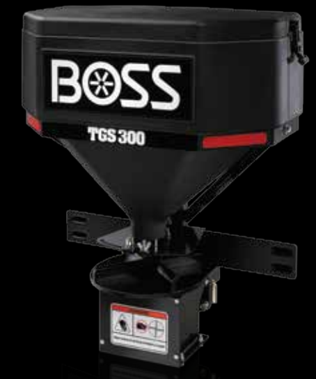
TGS 300 fits on vehicles with Class 2-4 hitches.

The selection of proper deicing materials can be complicated and varies by personal preference, experience and environmental concerns. All factors should be considered before making your selection.