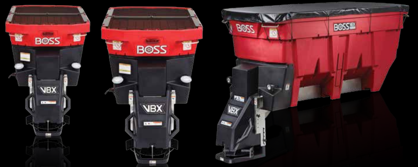
VBX 6500 1.5 cubic yards of capacity