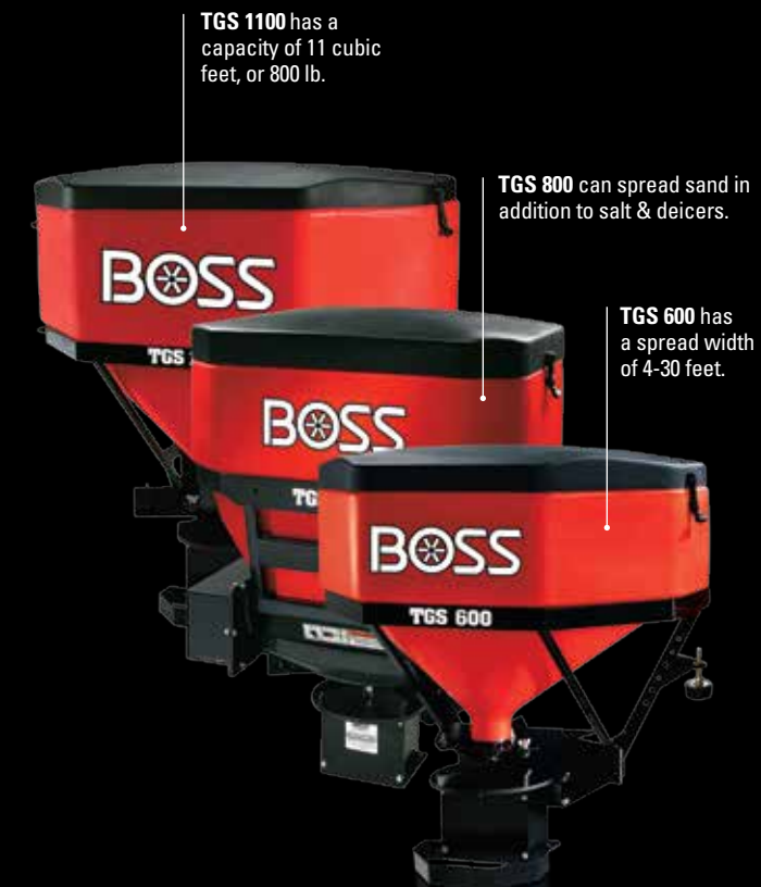
TGS 1100 has a capacity of 11 cubic feet, or 800 lb.