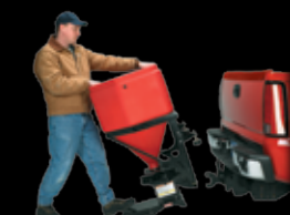
Optional RT3 Attachment System allows you to easily attach/detach your spreader (not available on TGS 300).