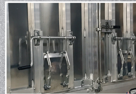
Optional Coal Chute