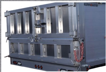
Optional 2-way tailgate