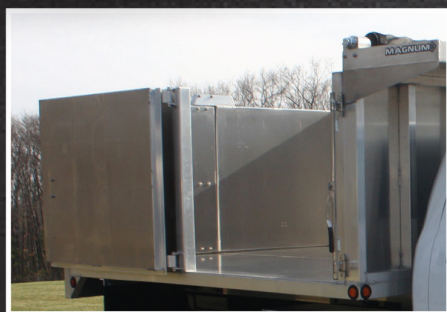
Optional 52" Wide Side Door

For more information, visit DuraMagTruckBodies.com