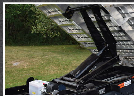
Optional Factory Installed Champion Hoist