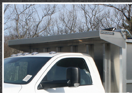
Optional Cab Shield up to 42"